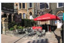
KESWICK Ravensworth House 29 Station Street