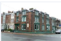
MARYPORT Waverley Hotel Curzon Street

FOR SALE Price Guide : £790,000 Freehold AVAILABLE Ref: MA1225