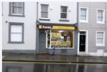
WHITEHAVEN Woodend Stores 92/93 Scotch Street