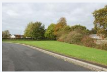
COCKERMOUTH Land Wakefield Road