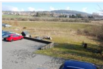
PENRITH Land at Mereside Eden Business Park

FOR SALE Offers Over : On Application Freehold AVAILABLE Ref: MA1286