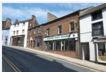
PENRITH 55-57 Castlegate

FOR SALE Price Guide : £120,000 Freehold AVAILABLE Ref: MA1150