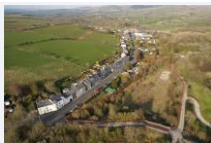
FRIZINGTON Land at Former Goods Yard Rowrah

FOR SALE Price Guide (+VAT) : £110,000 Freehold UNDER OFFER Ref: MA1191