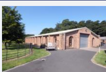
CARLISLE Coach Shed - Corby Castle Estate Great Corby